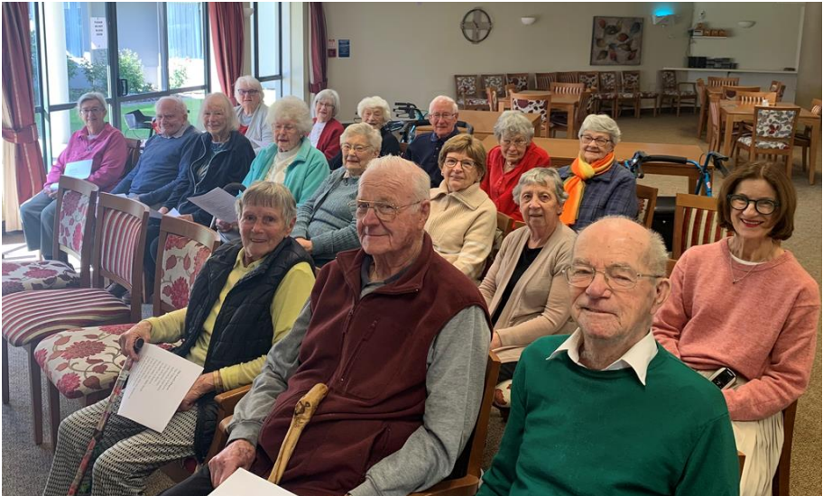
Service at Coastal Villas on 17 October

Did you know that our Parish has more congregations than the three that meet at our Waikanae, Raumati 10am and United@9 worship services?