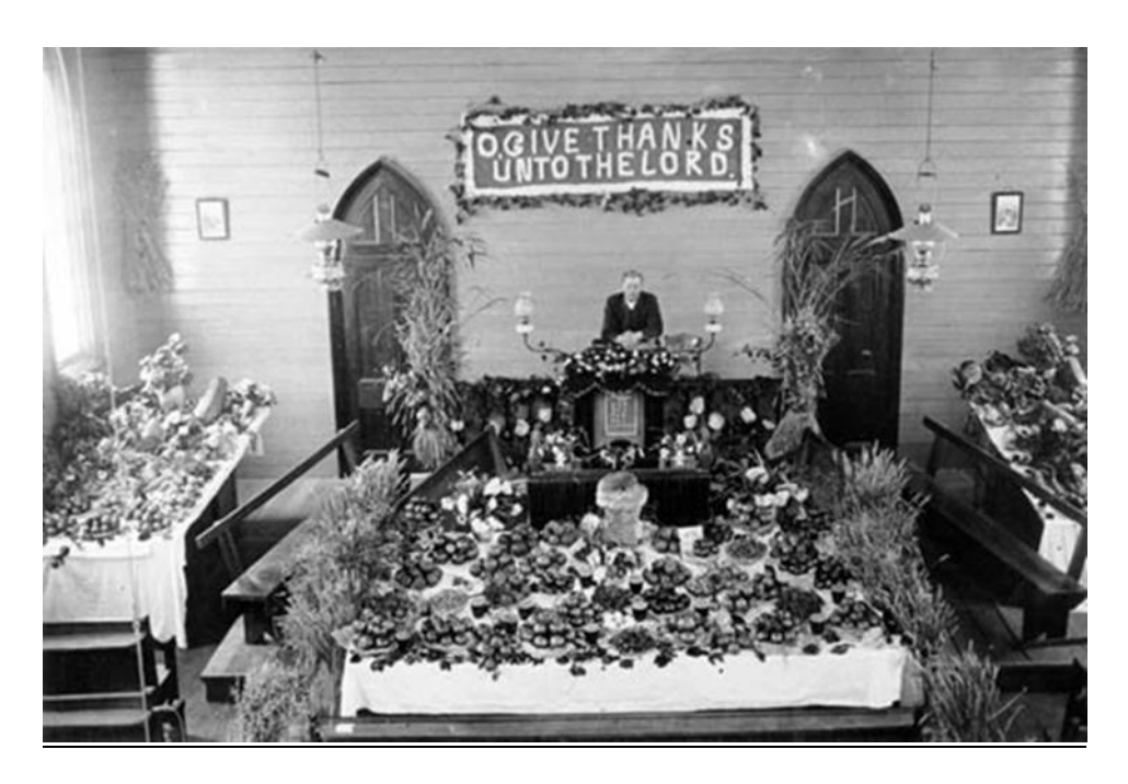
Harvest Festival at Greytown Methodist Church 1916